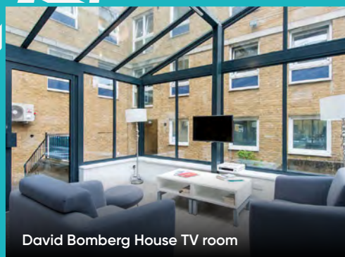
David Bomberg House TV room